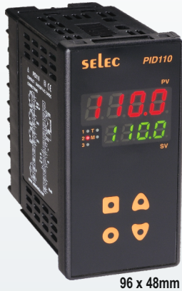
96 x 48mm